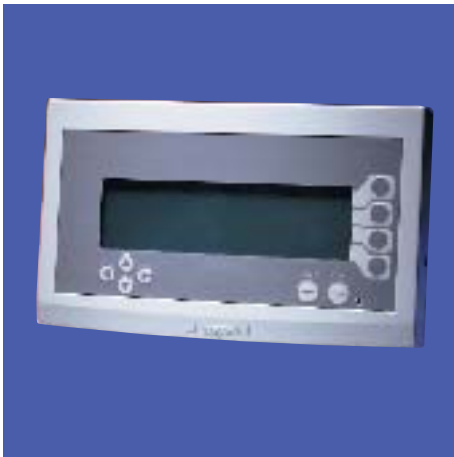
The self-guided menu on the RapidZone Command Display makes it easy to change temperature settings and schedules.

Try as you might, you can’t make everyone comfortable at once—and there’s a reason for that. Without zoning, your heating and cooling system treats the entire building as one “zone.” And each piece of HVAC equipment can only respond to a single input from its thermostat. A single zone unit simply can’t meet all occupants’ comfort needs. But Honeywell’s RapidZone™ Commercial Zoning System can.