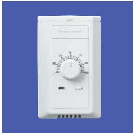
RapidZone Wall Modules feature an easy-to-use comfort dial for customized comfort in each room or zone.